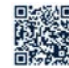
Y10 Option Handbook

As they move up the year groups, students will start reducing the number of subjects studied, allowing them to focus more fully on chosen subjects, studying them to greater depth, and generating a better basis of skills which will benefit them when they tackle their GCSEs/IGCSEs in Year 10 and Year 11.