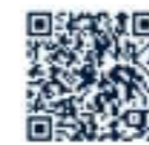
Y9 Option Handbook

When students enter Year 9, they will follow a different curriculum from the one in Year 8 and will be able to design some of their own curriculum by choosing subjects that match their own interests and abilities.