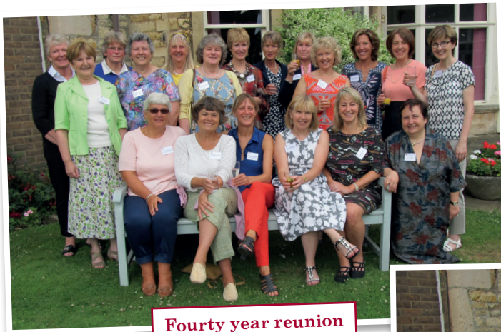
Fourty year reunion