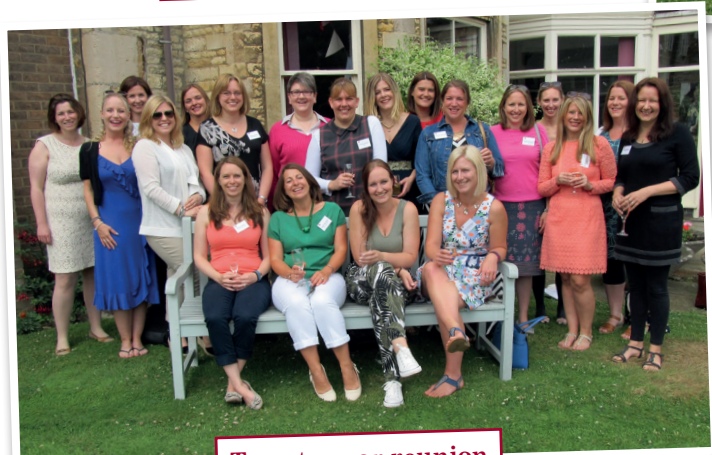
Twenty year reunion