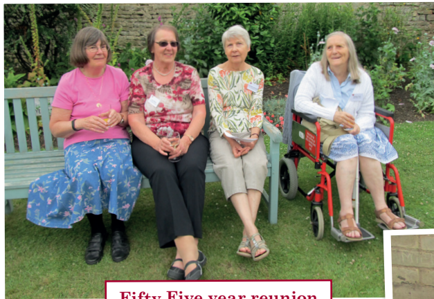
Fifty Five year reunion