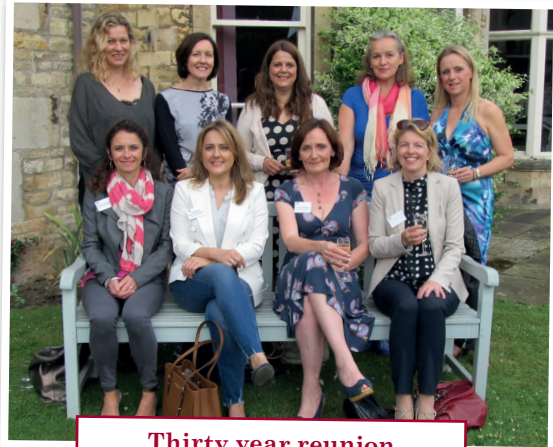
Thirty year reunion