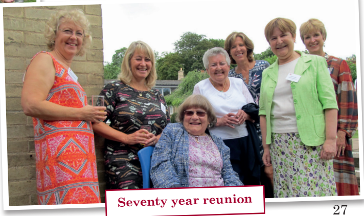
Seventy year reunion