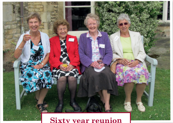
Sixty year reunion