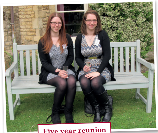
Five year reunion