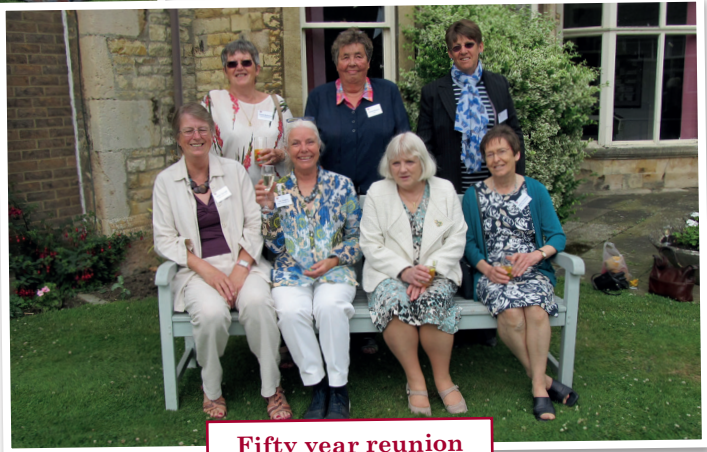
Fifty year reunion