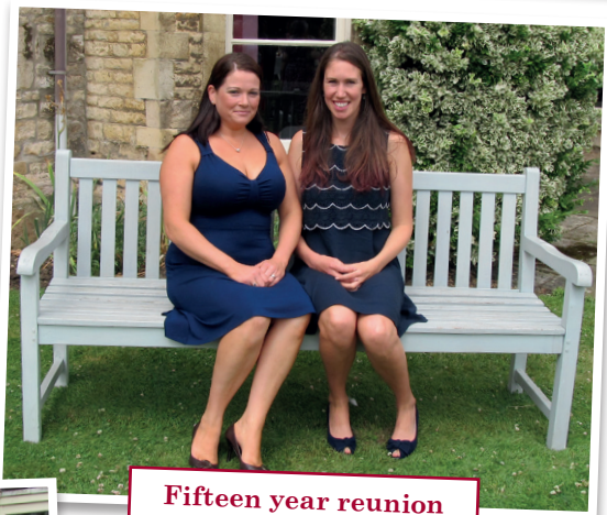
Fifteen year reunion