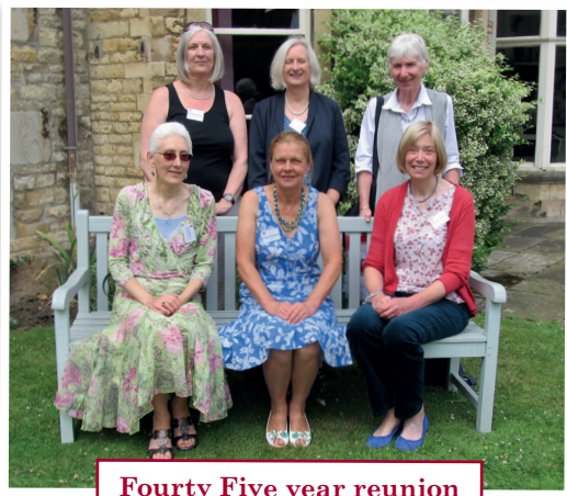
Fourty Five year reunion