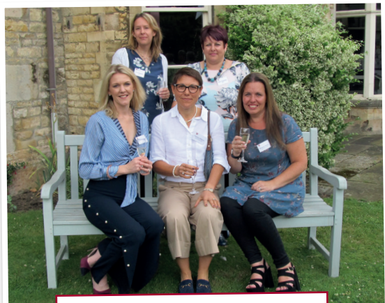
Twenty Five year reunion