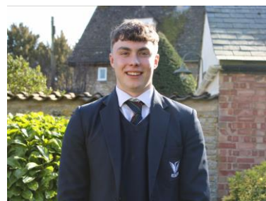
Northampton Saints Offer Trial To Y13 Student