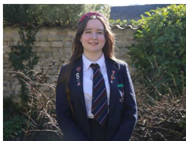
Y13 Receives Offer from The