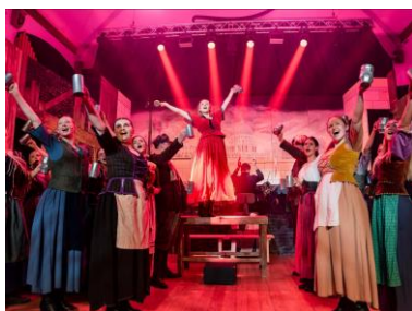
Oliver! Nominated for National Theatre Awards