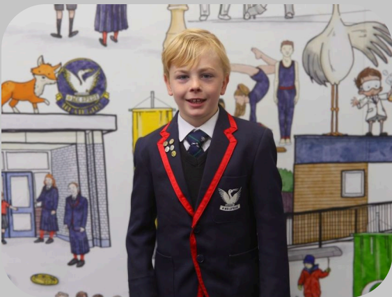
Climbing the height of Everest, aged nine