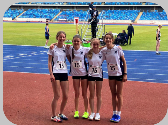
Year 8 Girls Shine at National Prep Schools Athletics